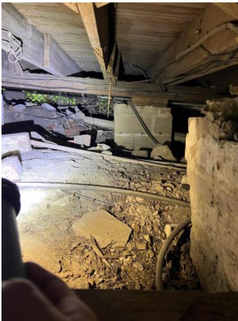
7 IMG_5752 Date Taken: 9/20/2022

4950 Meuse Street Metairie, LA 70001 (504) 488-3665 Fax (504) 218-8324 Contractor License # 50134