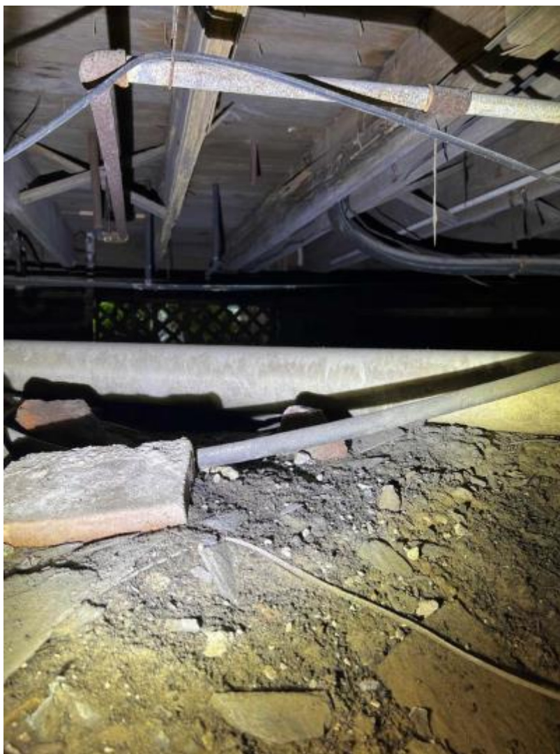
9 IMG_5754 Date Taken: 9/20/2022

4950 Meuse Street Metairie, LA 70001 (504) 488-3665 Fax (504) 218-8324 Contractor License # 50134