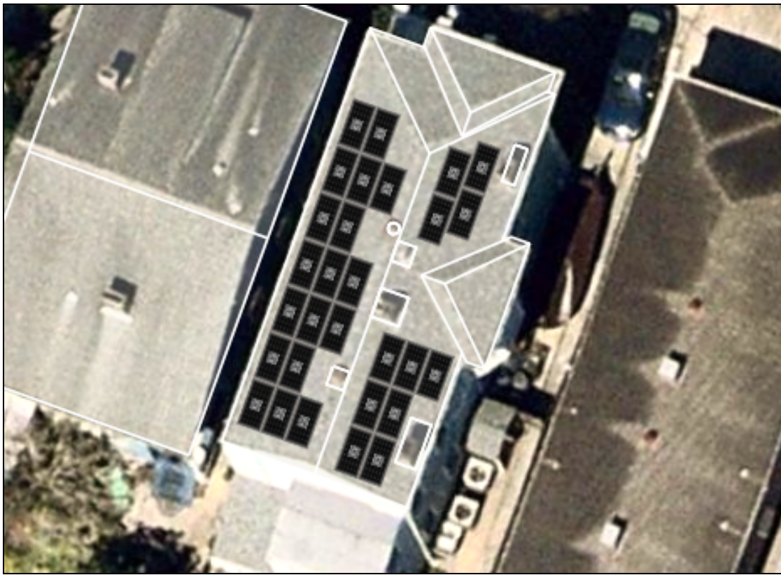
Composite of roof plan-view and array layout