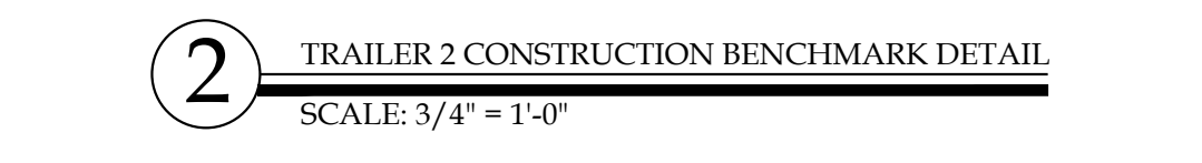
2 TRAILER 2 CONSTRUCTION BENCHMARK DETAIL SCALE: 3/4" = 1'-0"