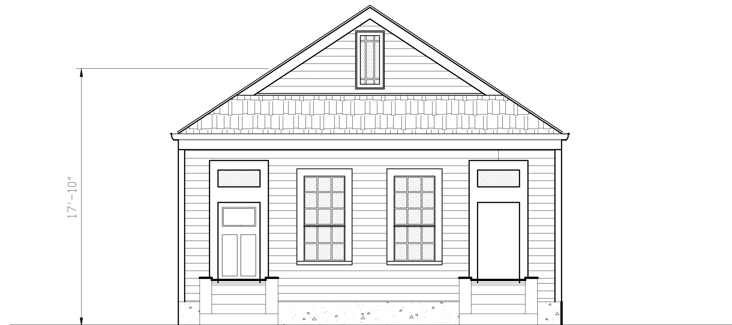
3 FRONT ELEVATION A1 SCALE: 1/4" = 1'-0" 2022-3