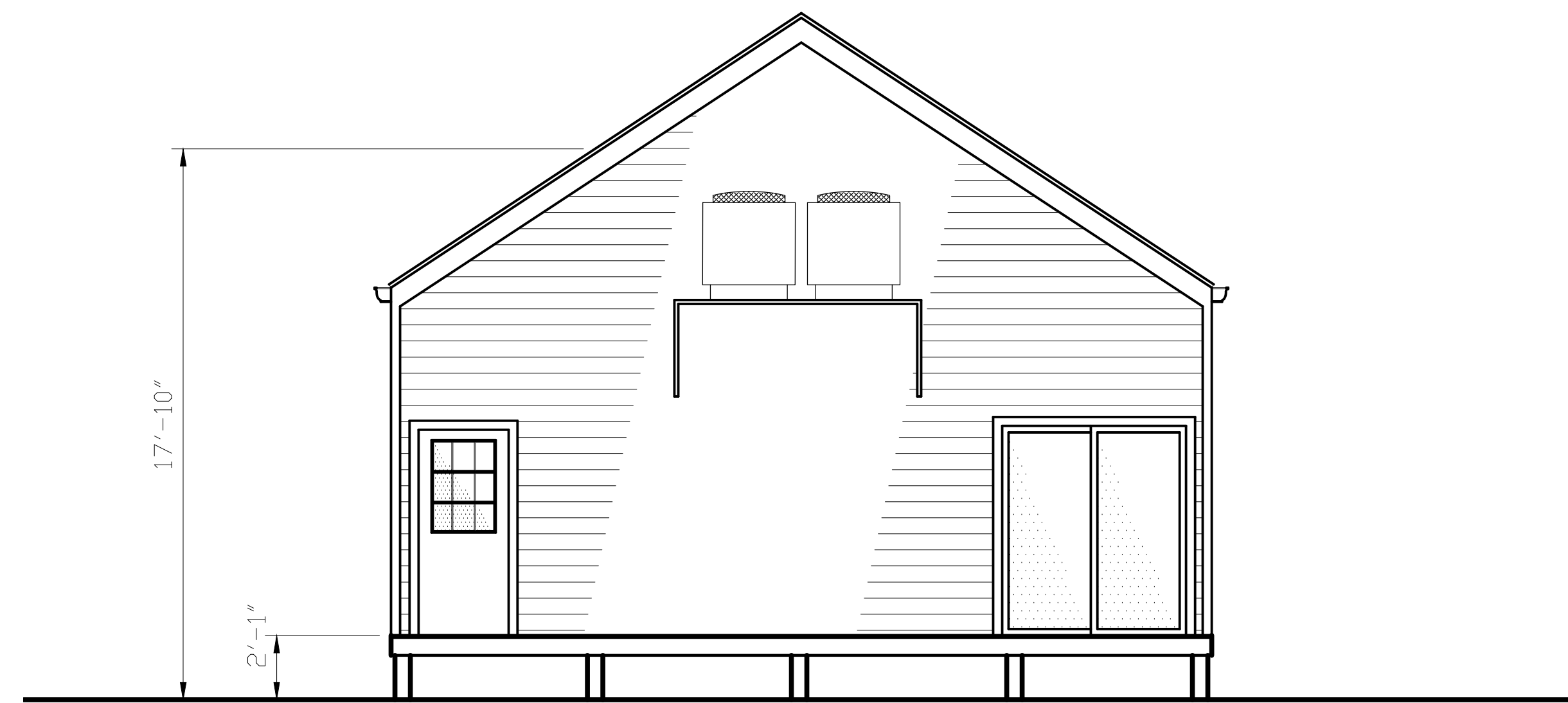
2 REAR ELEVATION A1 SCALE: 1/4" = 1'-0" 2022-3