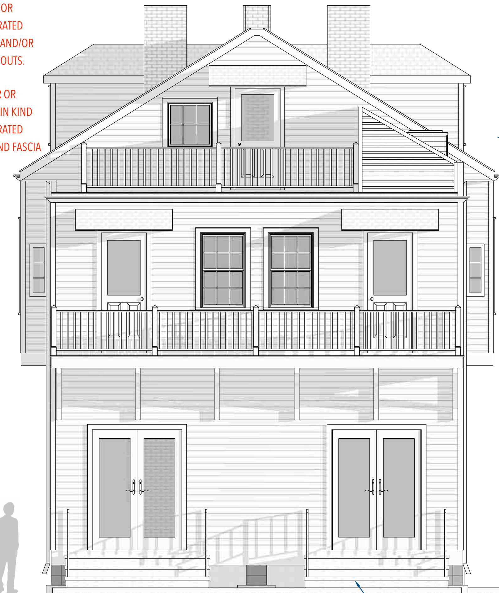
3 REAR ELEVATION SCALE - 1/4" = 1'0"