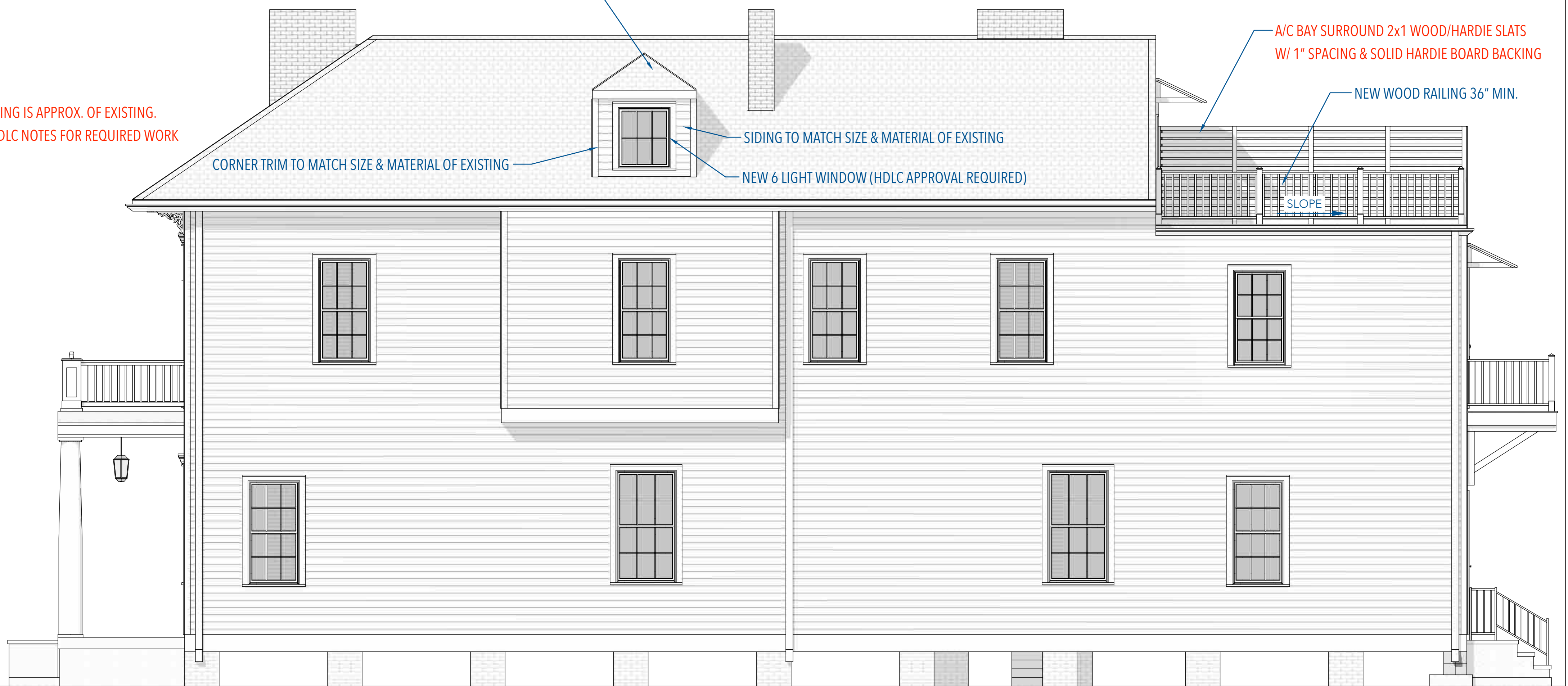
2 RIGHT SIDE ELEVATION SCALE - 1/4" = 1'0"