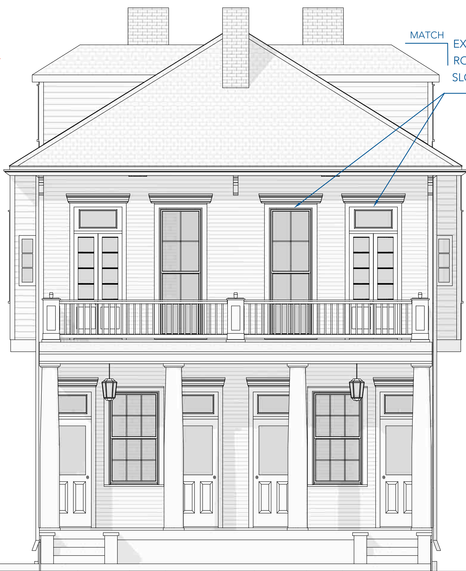
1 FRONT ELEVATION SCALE - 1/4" = 1'0"